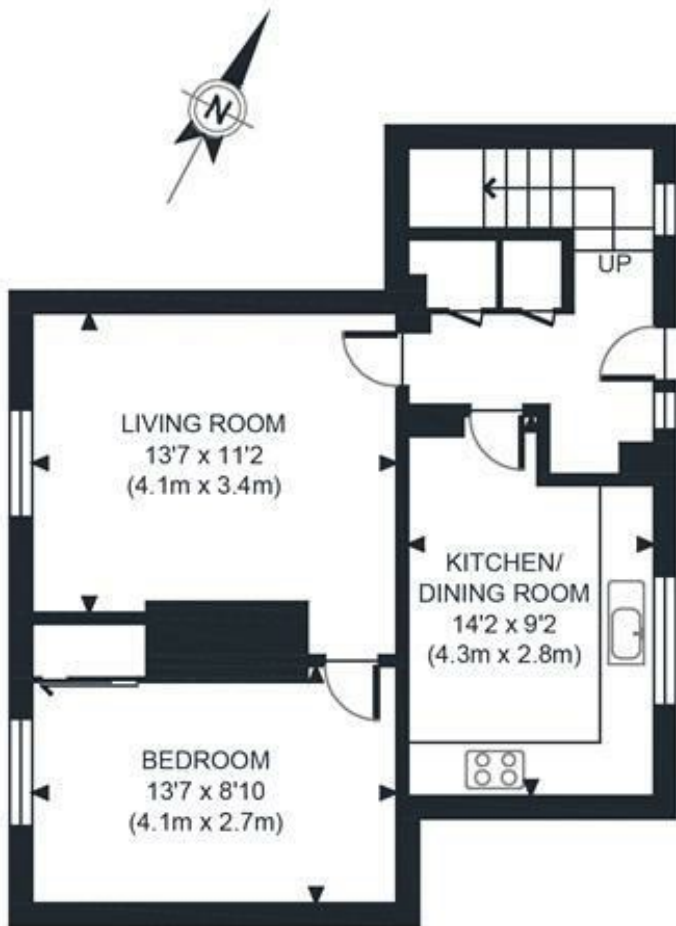
THIRD FLOOR GROSS INTERNAL FLOOR AREA 528 SQ FT